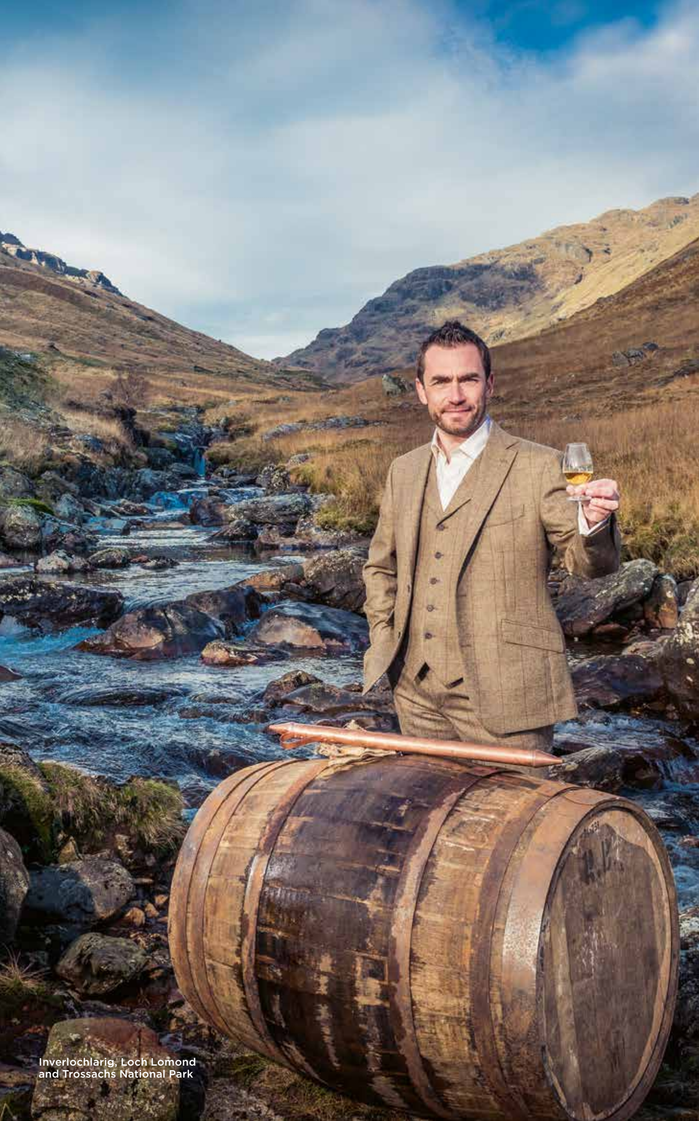
Inverlochlarig, Loch Lomond and Trossachs National Park

As you will discover, Scotland is a country of limitless possibilities.