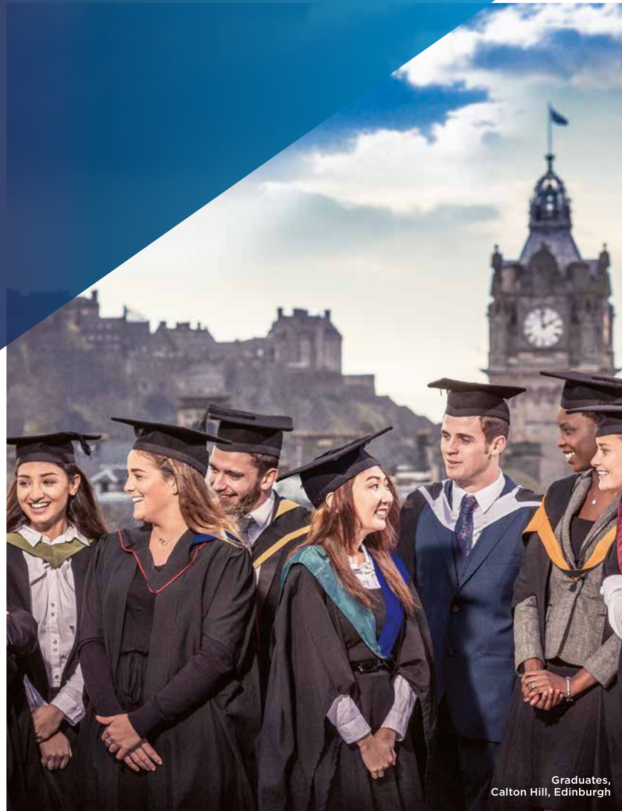
Graduates, Calton Hill, Edinburgh

SCOTLAND HAS LED THE WORLD IN A COMMITMENT TO EXCELLENCE IN EDUCATION FOR CENTURIES. FROM OUR PLACE AS THE FIRST COUNTRY IN THE WORLD TO PROVIDE UNIVERSAL EDUCATION BY ESTABLISHING A SCHOOL IN EVERY PARISH IN THE 17TH CENTURY, TO TODAY'S PIONEERING APPROACH TO LEARNING.