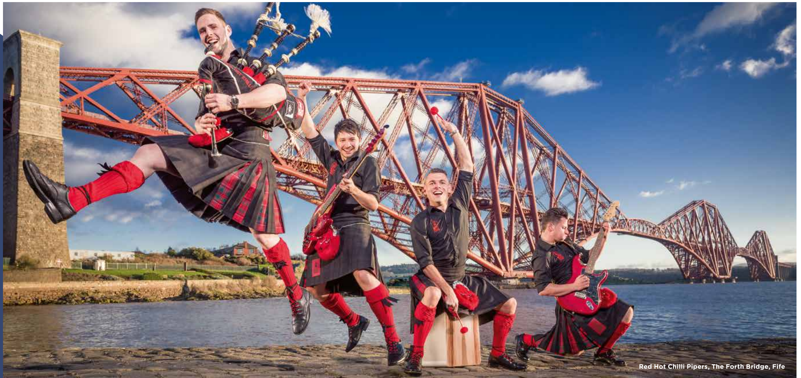
Red Hot Chilli Pipers, The Forth Bridge, Fife

So let us tell you a bit more about what makes our land, our Scotland.