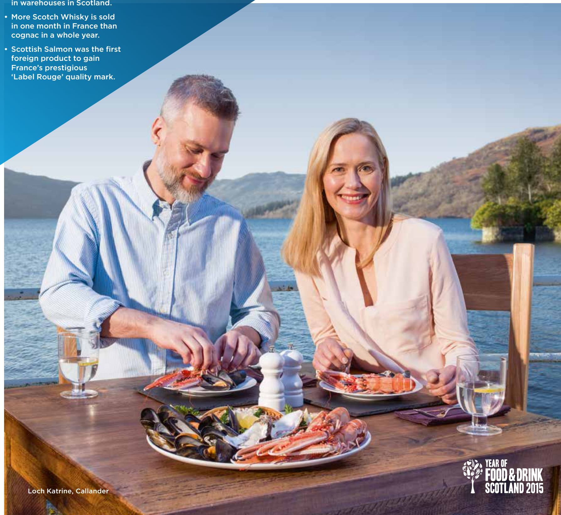
Loch Katrine, Callander